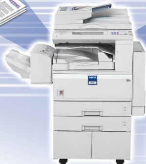
Savin Multifunctional System